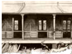
Eton High School founded