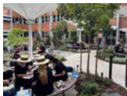
The Canopy Café and Forest