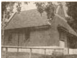
Darnell Art and Music Rooms