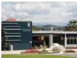
Eunice Science and Resource Centre