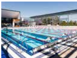
St Margaret's Sports Precinct