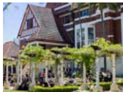
Godlee Arbour and Barley Sugar Garden