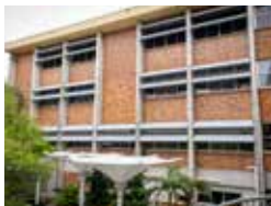
The Jackson Building