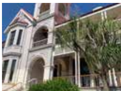
Community House Student Wellbeing Centre