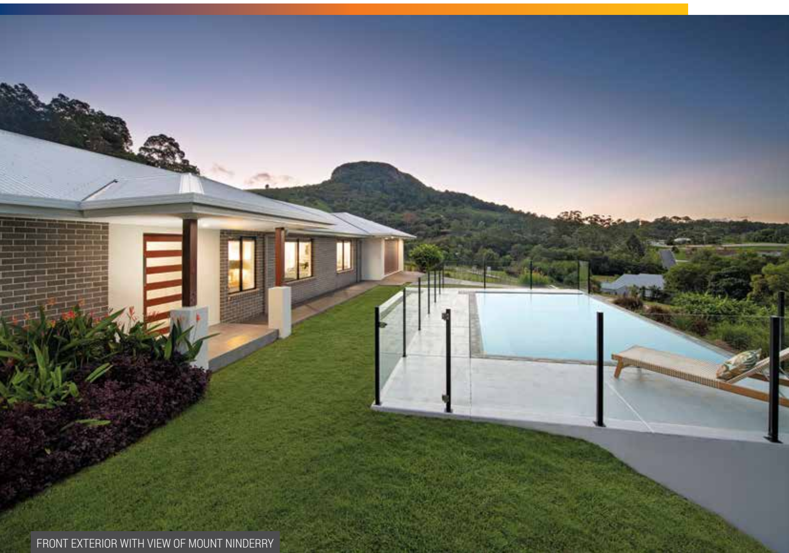
FRONT EXTERIOR WITH VIEW OF MOUNT NINDERRY