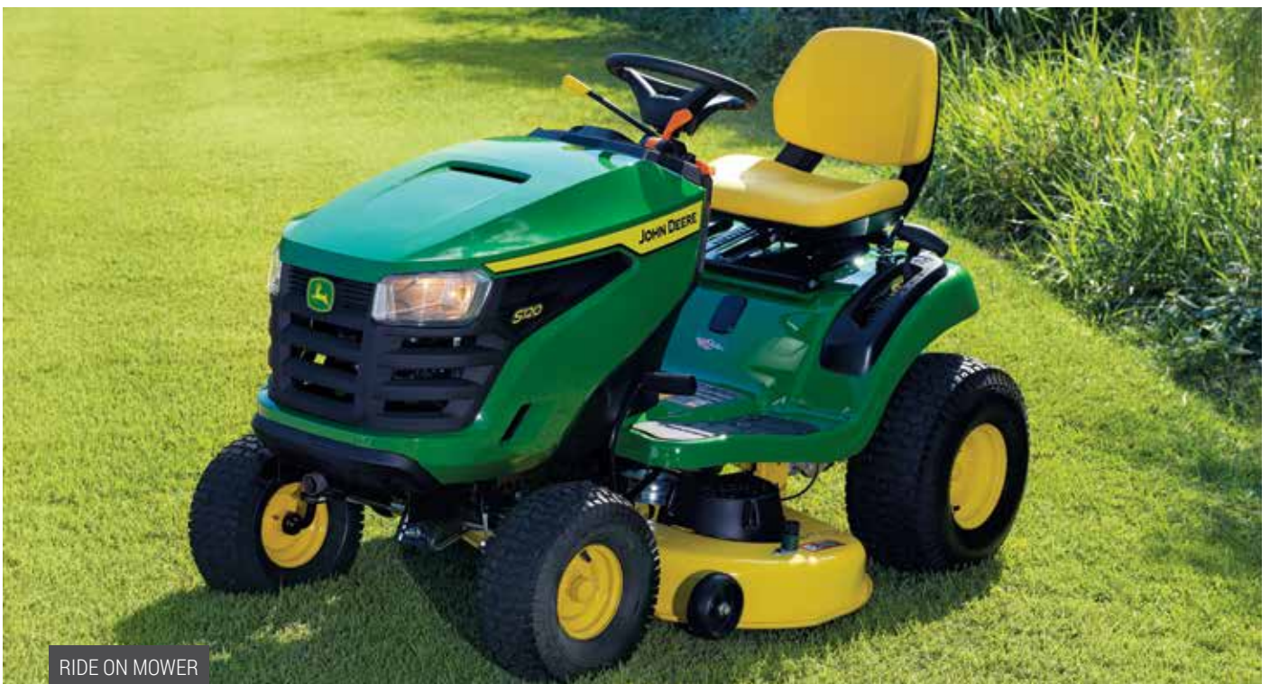
RIDE ON MOWER