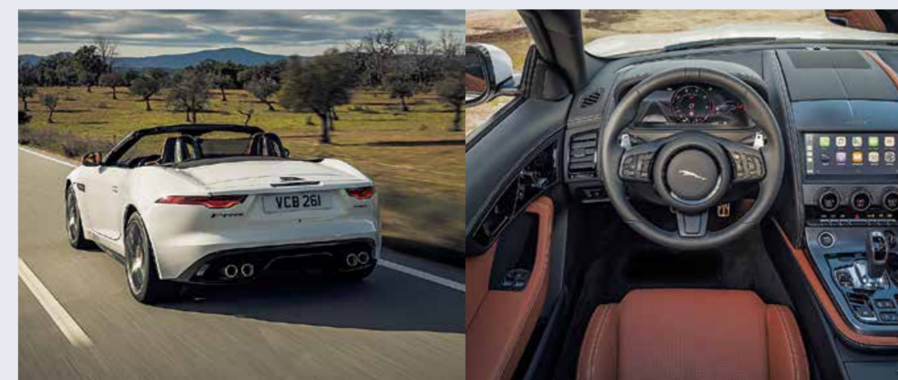
Jaguar F-TYPE *display images only