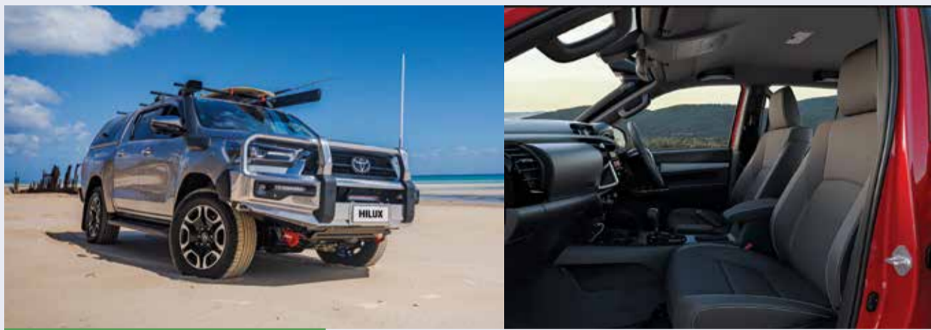
Toyota Hilux SR5 *display images only