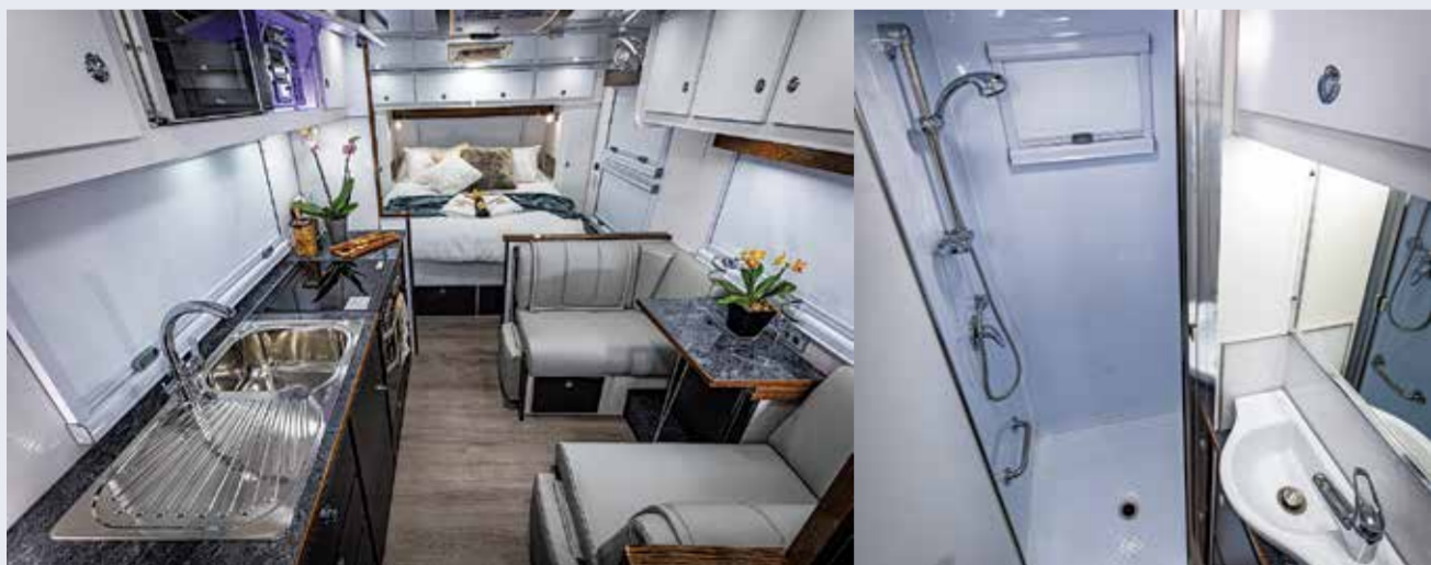
Kedron Caravan *display image only