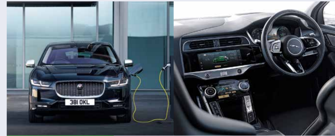
Jaguar I-PACE *display images only