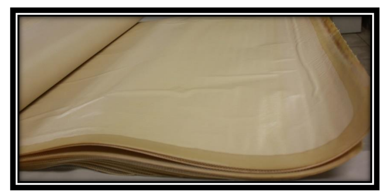
Membrane was fouled with a thin layer of scale

The first stage lead element was fouled with biological matter and suspended solids. The last stage tail element was fouled with phosphate scale, polymerized silica, suspended solids, and biofilm. Delamination had caused an irreversible 3% loss in salt rejection.